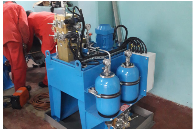
New Hydraulic Control Module